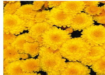
Yellow / Gold