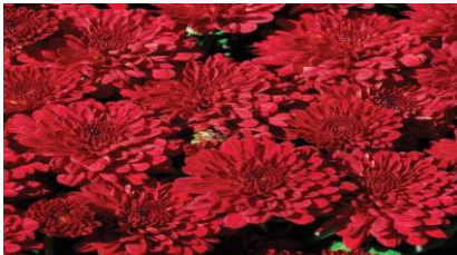
Red / Burgandy